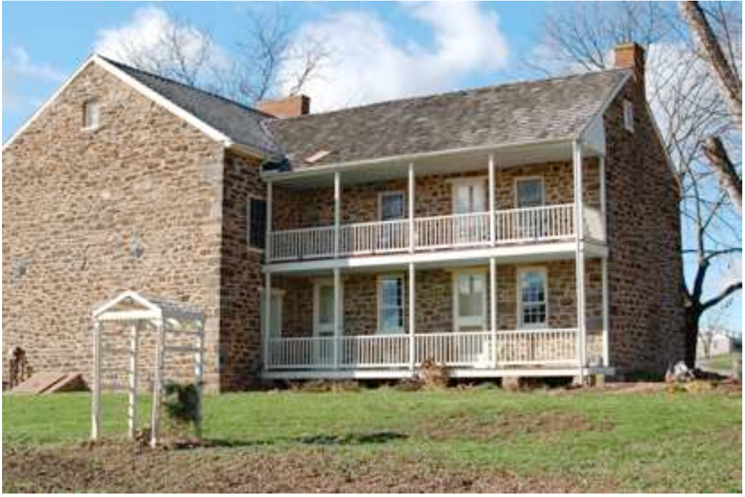
Figure 2. Daniel Lady Farm on Hanover Road in Gettysburg, Pennsylvania.

The home was occupied for several years with carpets used to cover the stained floors and shrapnel from artillery shells imbedded in the walls. In 1999 the Gettysburg Battle Field Preservation Association purchased the property and has worked to restore it to its original appearance. The restoration has been done with historical accuracy with preservation of significant artifacts as a priority. Archeological excavations outside the home and barn have resulted in the recovery of additional artillery shrapnel, whole, unexploded artillery shells, bullets, uniform buttons, knives, and other miscellaneous artifacts as well as human bones. The Association intends to open the Lady Farm as a field hospital museum and a working period farm exhibit (Figure 2).