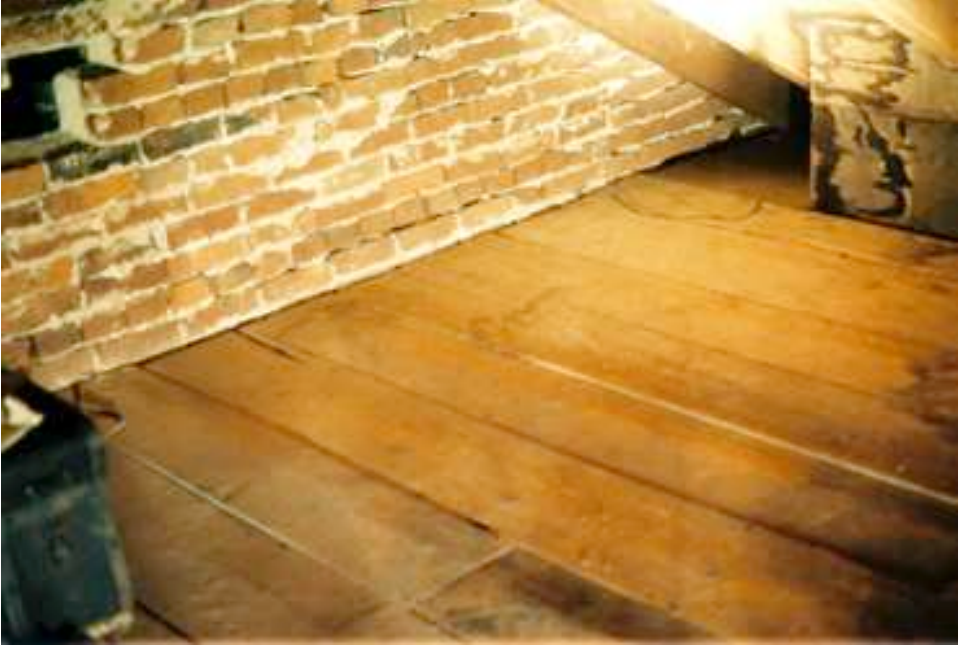
Figure 4. Attic of the Shriver House- The site of the shooting of the Confederate sniper.

The area under the porthole was then exposed to the Bluestar® Latent Bloodstain Reagent and the results were photographically documented. A chemiluminescent reaction was observed in the area under the porthole showing a pattern consistent with a cloth or mop having been used to wipe up in the area. The reaction was clearly visible but of a lesser intensity as than previously observed with stains of modern origin (Figure 5). Also noted is that a distinct line of demarcation was observed at the edge of floorboards a few feet from the porthole. It was learned that the boards that did not react had been replaced during restoration and were not the same boards in place during the battle.