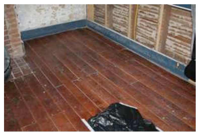
Figure 6. Daniel Lady Farm-Site of Confederate Field Hospital with heavy gauge plastic protecting bloodstains on floor.

In order to protect the integrity of the historical artifacts, the visible stains on the floor of the Daniel Lady Farm were covered with heavy gauge plastic sheeting. A small area at the edge of the visible stain was left exposed as a control. Test applications were conducted away from the stains (Figure 6). A light amount of background luminescence was noted in a few areas and where nail heads appeared in the wood. Most of this was very dim, whiter in color and lasted a short duration.