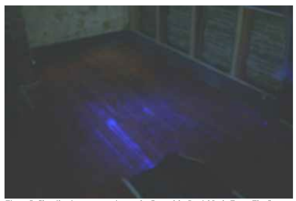
Figure 7. Chemiluminescent reaction on the floor of the Daniel Lady Farm. The flow pattern has originated from the visible stains.

The area surrounding the visible stains (along with the small exposed section) was then subjected to the Bluestar® Reagent with positive results. Low level luminescence observed at the Shriver House was visible at the exposed control stain area. The chemiluminescent reaction continued several inches outward from the known stain area and showed a flow pattern that followed the contours in the floorboards. This accumulated in an area with a gap opening at the end of two of the boards. A dim irregular background luminescence was observed in a widely distributed pattern around this stain (Figure 7).