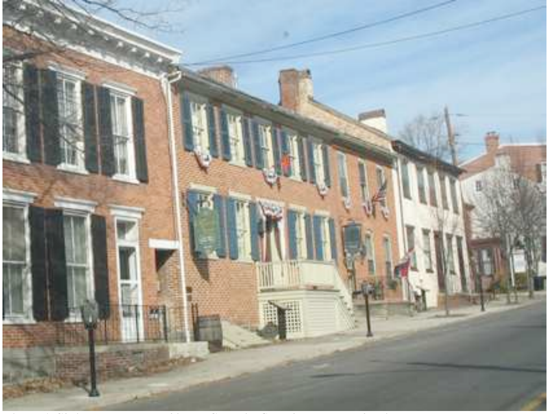
Figure 1. Shriver House on Baltimore Street in Gettysburg, Pennsylvania.

A Confederate "snipers nest" was established in the attic. Bricks were removed from the attic wall to form portholes from which to fire upon the Union soldiers. A neighbor later described watching the Confederates through an attic window. According to historical records, one of the Confederate sharpshooters was apparently struck by a bullet and killed directly in front of one of the makeshift portholes. The death and removal of the body was described in detail by the witnessing neighbor. Records show that the body of at least one other sniper was later carried out of the house. The Shriver House is located on Baltimore Street and was owned by George and Henrietta Shriver. George Shriver had hoped to open a tavern and tenpin alley before the war. After enlisting in the Union Army he was captured and died in Andersonville (the notorious Confederate prisoner of war camp). The Shriver House has been restored with great care taken to retain much of the original building materials. The Shriver House is now a private museum that features the impact of the battle on the civilians of the town (Figure 1).