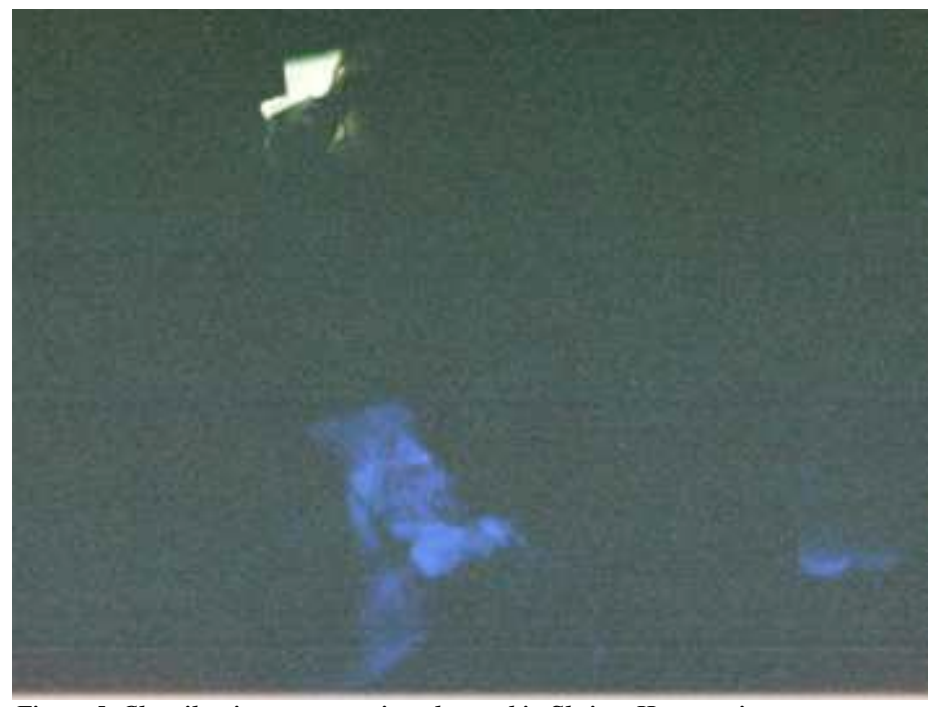
Figure 5. Chemiluminescent reaction observed in Shriver House attic.