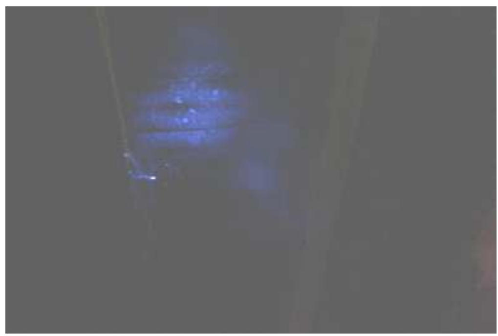
Figure 9. Chemiluminescent reaction observed on the basement ceiling. No reaction was observed in the tongue and groove seams or on the replaced beam.